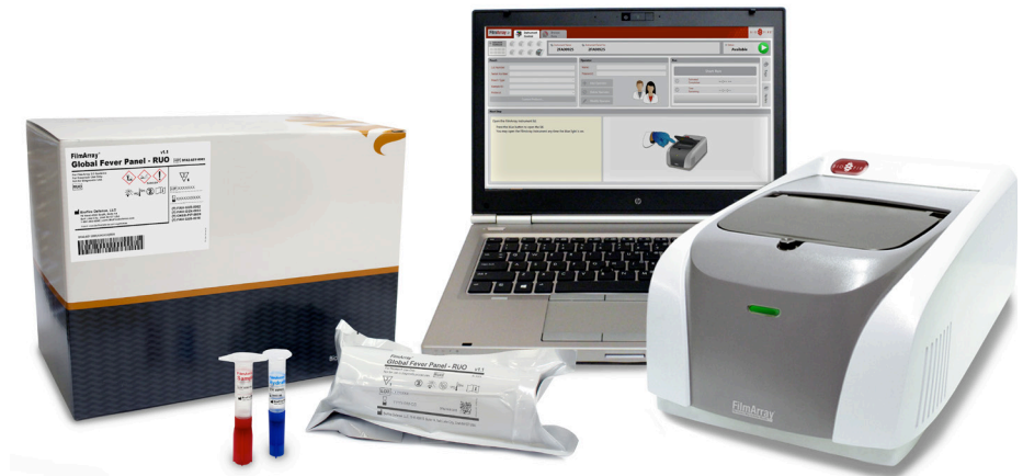
FilmArray Global Fever Panel - RUO with BioFire FilmArray® 2.0 System

Leishmania spp. Plasmodium spp. P. falciparum P. vivax/ovale